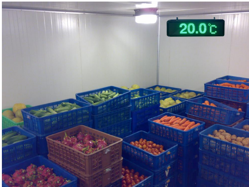
Agricultural product storage temperature monitoring