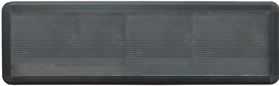
Led Screen Display